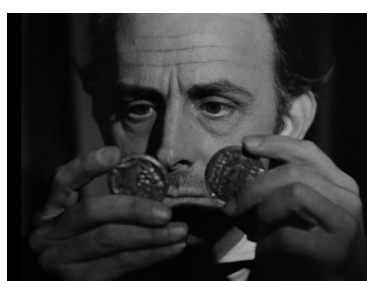
ALL THAT MONEY CAN BUY (1941, d. William Dieterle)