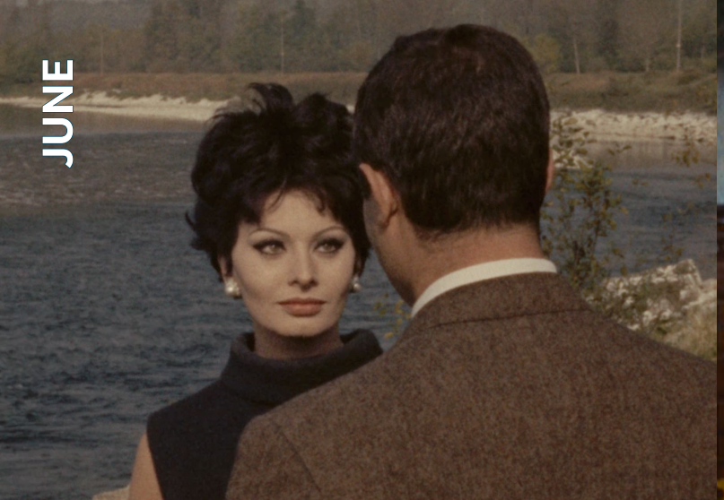
Il Cinema Ritrovato presents the world restoration premieres of ÈL and YESTERDAY, TODAY AND TOMORROW (pictured), along with 10 other TFF-funded restorations. Screenings of GIANT and YESTERDAY, TODAY AND TOMORROW took place in the Piazza Maggiore.

BAMPFA presents "Film Preservation: Celebrating The Film Foundation," a two-month program of over 20 TFF-supported restorations.