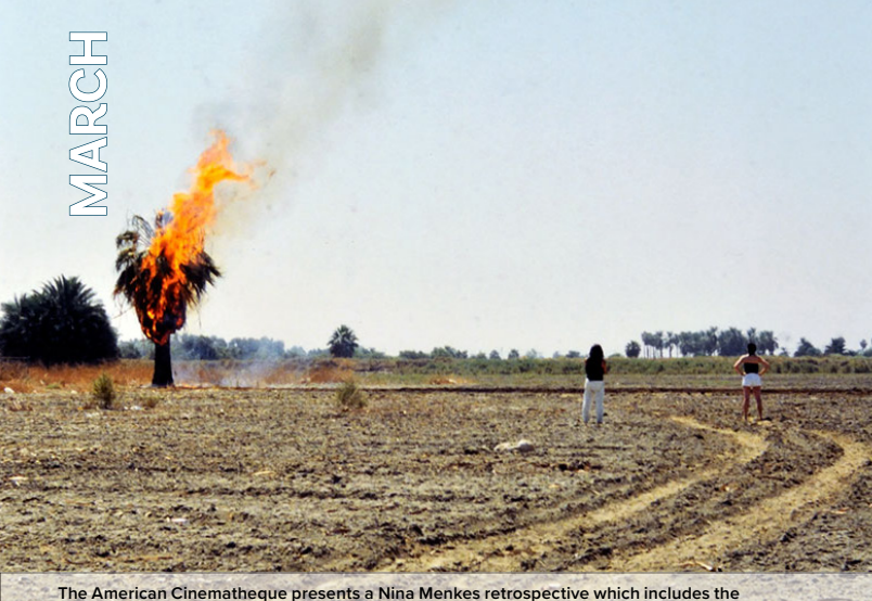
The American Cinematheque presents a Nina Menkes retrospective which includes the TFF-supported restorations of THE BLOODY CHILD and QUEEN OF DIAMONDS (pictured).