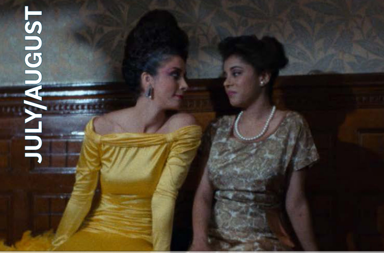
ALMA'S RAINBOW (pictured) screens at the Brooklyn Academy of Music (BAM) before traveling to select theaters nationwide.

BAMPFA presents "Film Preservation: Celebrating The Film Foundation," a two-month program of over 20 TFF-supported restorations.