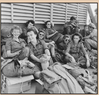
Nurses stationed in Guam in the South Pacific