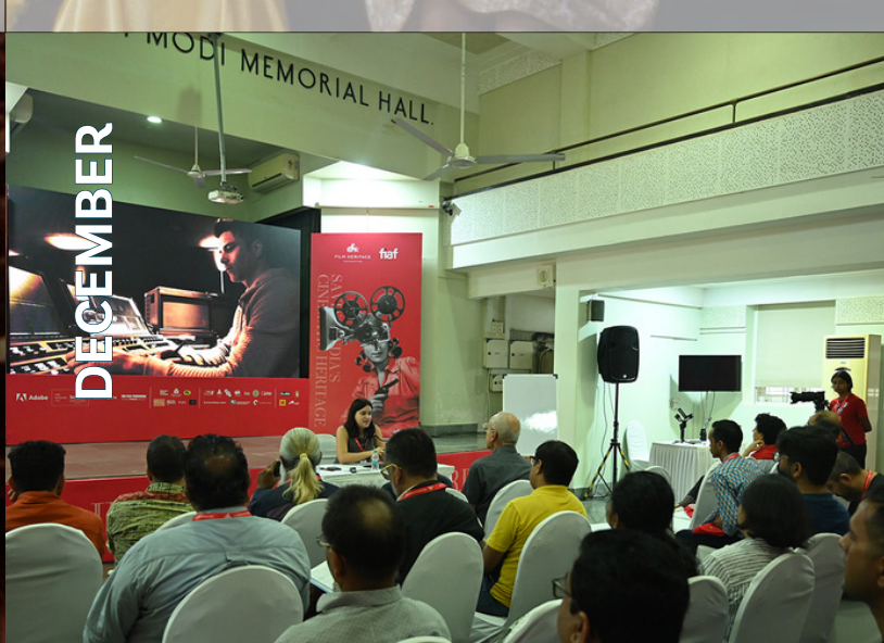
The Academy Film Archive's "Present Past: A Celebration of Film Preservation" includes world restoration premieres of NOT A PRETTY PICTURE, THE STRONGER, TELL ME A RIDDLE and THE WORLD'S GREATEST SINNER along with eight other TFF-supported restorations.

The 7th Film Preservation & Restoration Workshop India takes place in Mumbai (pictured).