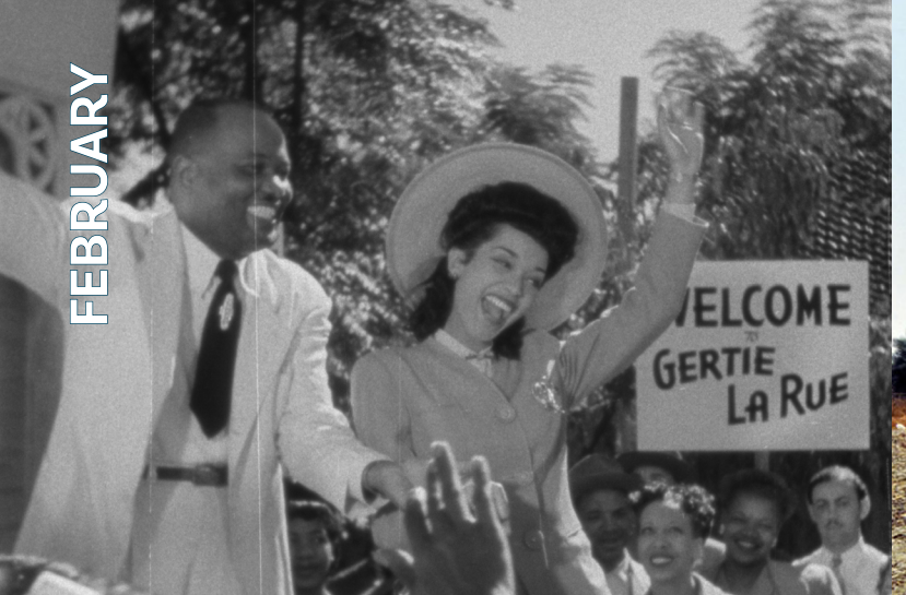
Cinema Revival: A Festival of Film Restoration presents the restorations of THE BLOODY CHILD, DIRTY GERTIE FROM HARLEM U.S.A. (pictured), KUMMATTY, MURDER IN HARLEM, THE OLIVE TREES OF JUSTICE, and SAMBIZANGA.