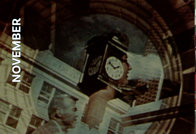
The NFPF Avant-Garde Masters Grant program supports the restoration of seven films including Lawrence Gottheim's YOUR TELEVISION TRAVELER (pictured) and PLUMB LINE, RED NEWS, and VIET-FLAKES by Carolee Schneeman.

A film noir double feature of THE CHASE and DETOUR are presented in The Film Foundation Restoration Screening Room.