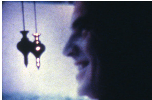
PLUMB LINE (1971)

The NFPF Federal Grant Program provides funds to libraries, archives, and museums across the United States that are authorized and appropriated by the U.S. Congress under the National Film Preservation Act of 1996. Focusing on orphan films with cultural and historical significance, the grant ensures that preservation masters and public access copies can be created. Under the terms of the legislation, the NFPF is required to raise matching funds from non-governmental entities to support its operations. Therefore, The Film Foundation's contribution is crucial in underwriting these expenses. In 2022, 28 grants were awarded resulting in the preservation of 61 films, and to date, the NFPF has helped preserve more than 2,693 films at institutions in all 50 states, Puerto Rico, and the District of Columbia.