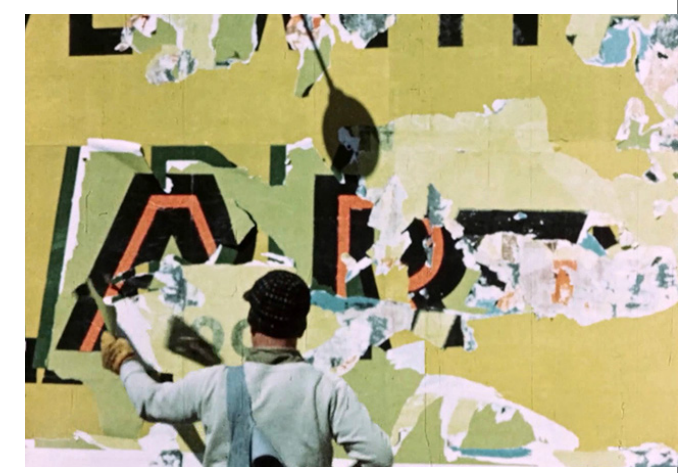
THE COLOR OF THE DAY (1955)